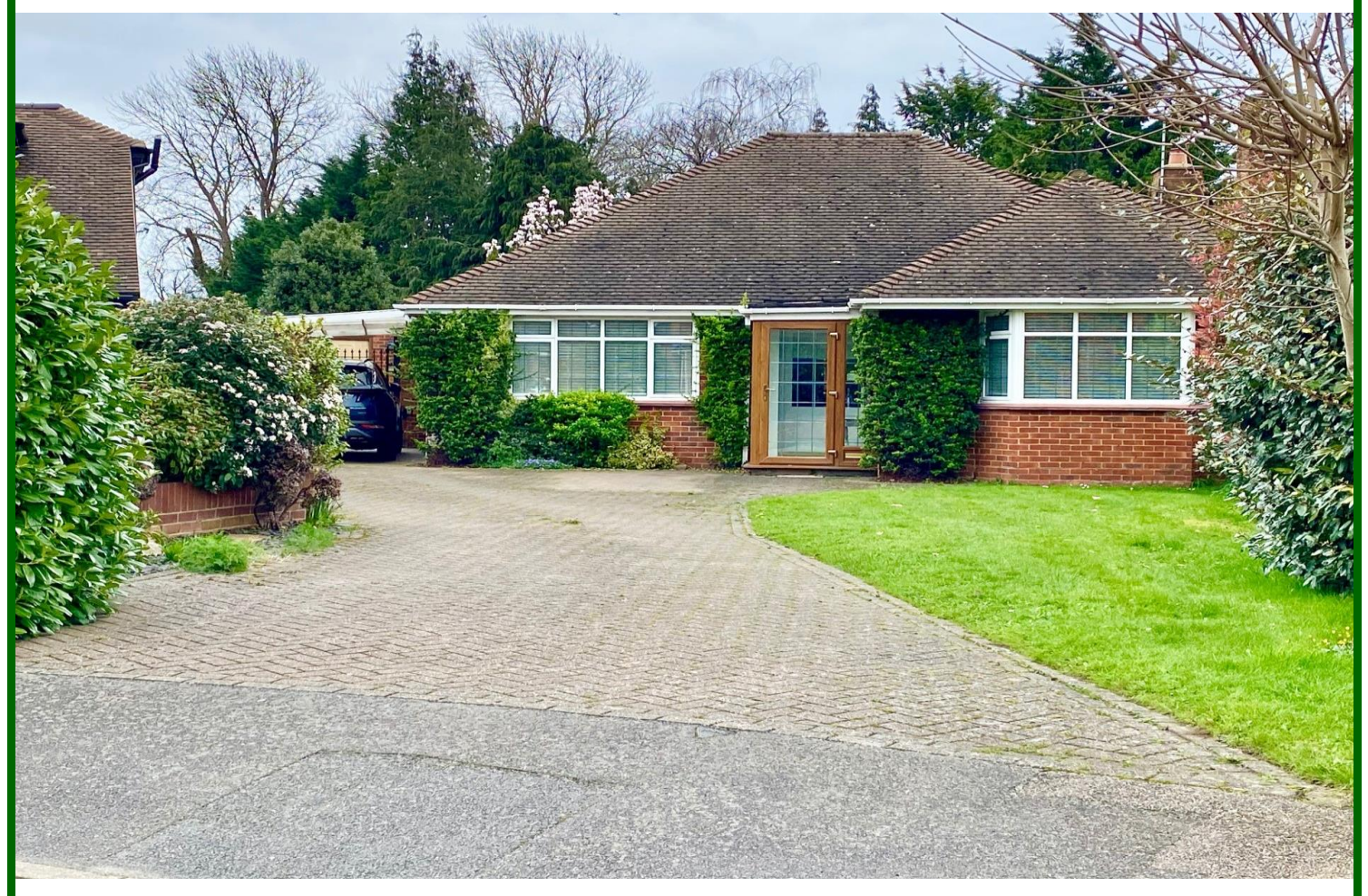
* CHAIN FREE * SPACIOUS DETACHED BUNGALOW * * LARGE GARDEN * POPULAR CUL DE SAC LOCATION * GARAGE * * OFF STREET PARKING FOR MULTIPLE VEHICLES * GAS CENTRAL HEATING * * DOUBLE GLAZING *